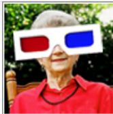
A New Dimension

Outsourcing is reaching new levels of creativity as entrepreneurial minds figure out more and more tasks that can be sourced elsewhere.