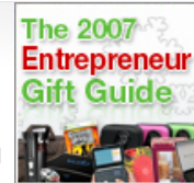
2007 Holiday Gift Guide

Wine shops and bars from across the country recommend their favorite holiday wines.